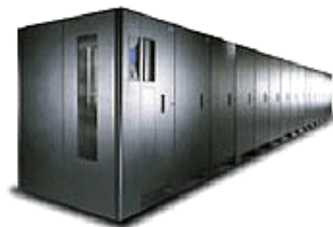
IBM TotalStorage Ultrium Scalable Tape Library 3583 規格一覽表