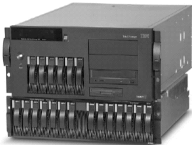
IBM NAS 300G Supported Protocol: NFS, HTTP, FTP, CIFS Netware