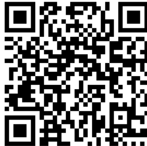
Course website QR Code