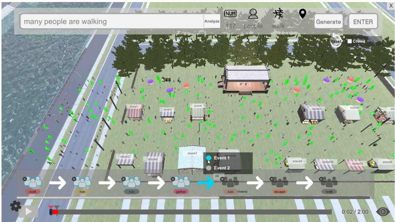
Figure 1: The user interface. The input component accepts strings as input. It is on top left. The visual feedback component is on the top right. It shows the parsed result of a sentence. In this case, we have quantity (117), characters (people), and behavior (walk). The crowd scene component renders and animates characters of crowds in real-time. The characters are highlighted in green when they are being controlled or created so that users can view the result at once and the amount of the characters can be adjusted promptly. The editing component is on the bottom. The basic animation units are linked and each of them is represented by an icon with a behavior label. The behavior label is useful when the basic animation units are manipulated. A basic unit can be deleted and our system regenerates the crowd scene accordingly. Scene events (e.g., Event 1 and Event 2) can be set as a precondition of a basic animation unit. The arrows indicate the execution order of the basic animation units. A time line is at the bottom-most part of the user interface. Users can drag a play time at an instance to start the animation.