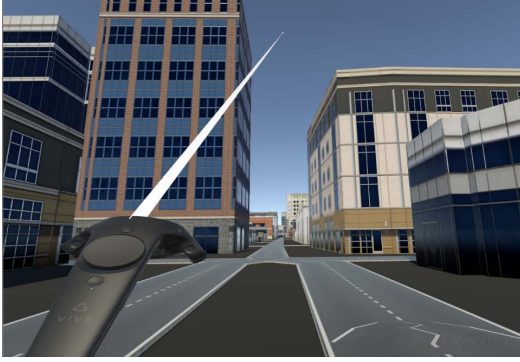
Figure 2. The virtual city study environment

the player's movement in the virtual world, while the left one consisted of a beam pointer that could be used to interact with the buttons and mobile interface in the virtual scene.