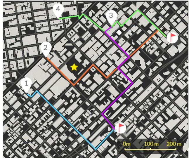
Figure 3. Map of the virtual study area, showing four wayfinding-task routes, color-coded by complexity level. (Route 1 has 3 turns; route 2 has 4 turns; route 3 has 5 turns; route 4 has 6 turns)

After they had finished each experimental task, they were asked about how difficult they had found it, and were given a 3-minute break to prevent motion sickness. We also asked them to fill out the VR sickness scale [6] so we could measure how many discomfort may have affected their navigation performance.